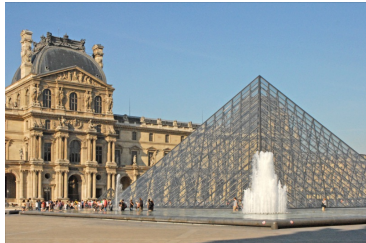
Musée du Louvre